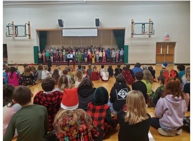
Student rehearsing their holiday songs for the evening concert