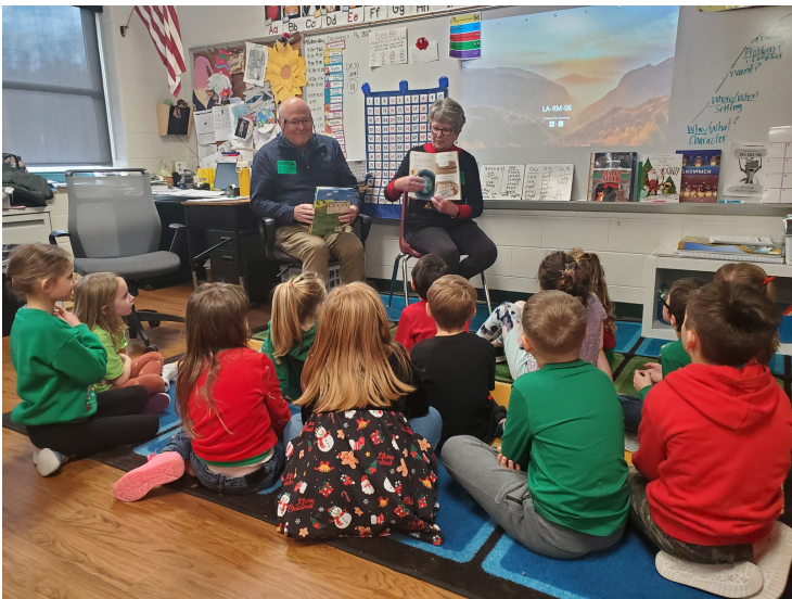
Rotary Club volunteers visit First Grade classrooms for a fun read aloud