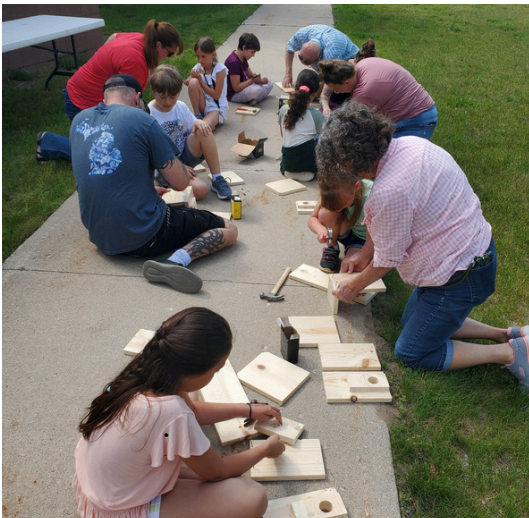
Left: first graders work with adult volunteers to build their own birdhouses to take home!