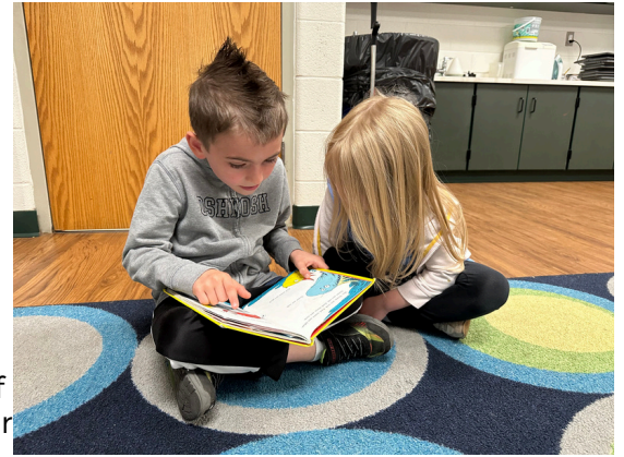
Right: Preschool paid a visit to their future kindergarten classrooms this spring. Kindergarteners showed off their reading skills with their preschool buddies!