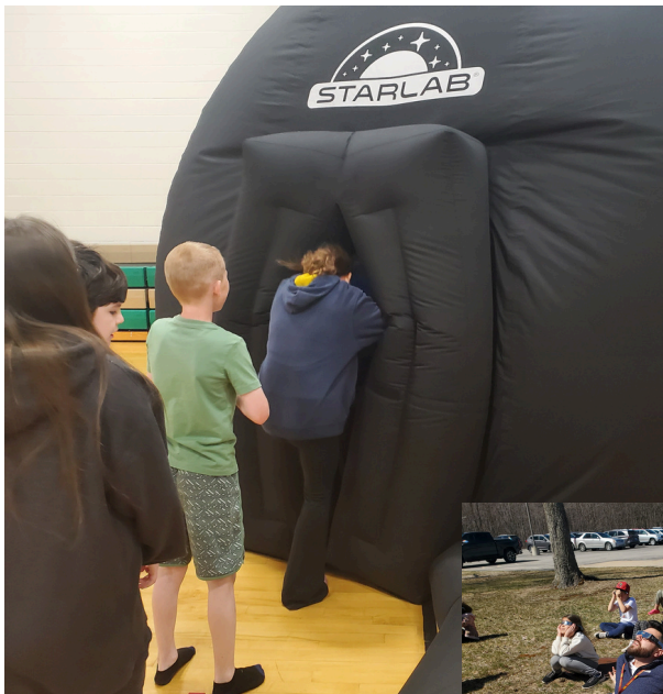
Left and Right: The National Lakeshore visited Lake Ann for K-5 classes to enjoy learning about the night sky within their amazing planetarium and also through Indigenous historical stories from our area Below: LAE staff and students admires the solar eclipse as a school community