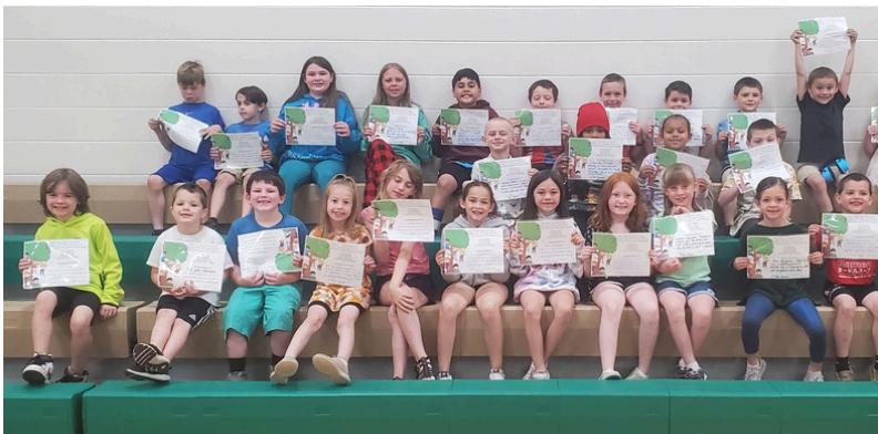
Above: June 2024 'Caught You Being Great' SEL Assembly