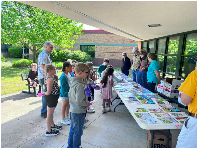
Above: Our wonderful Benzie Rotarians and Lions Club visited Lake Ann to host a walk up book fair for our last Power Book Bags! All students had the opportunity to self-select 2 books to take home for summer reading!